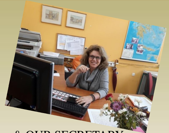
& OUR SECRETARY